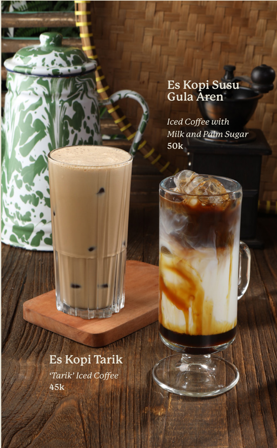
Es Kopi Susu Gula Aren

Iced Coffee with Milk and Palm Sugar 50k