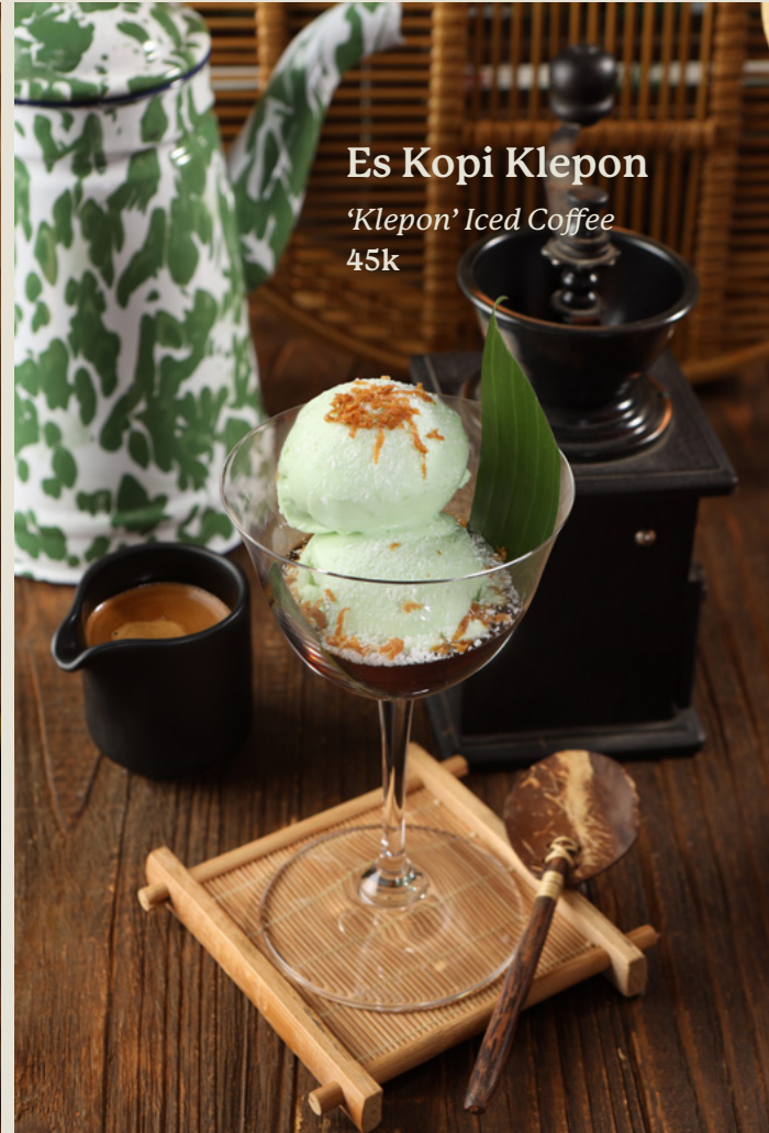
Es Kopi Klepon