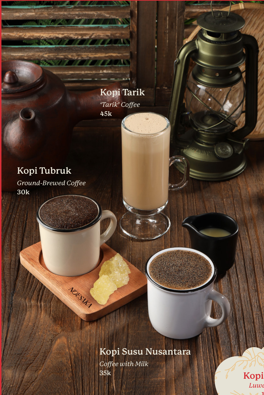
Kopi Tarik 'Tarik' Coffee 45k